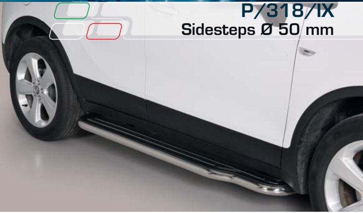
P/318/IX Sidesteps Ø 50 mm