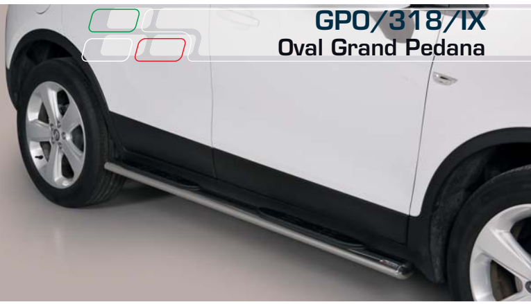
GPO/318/IX Oval Grand Pedana