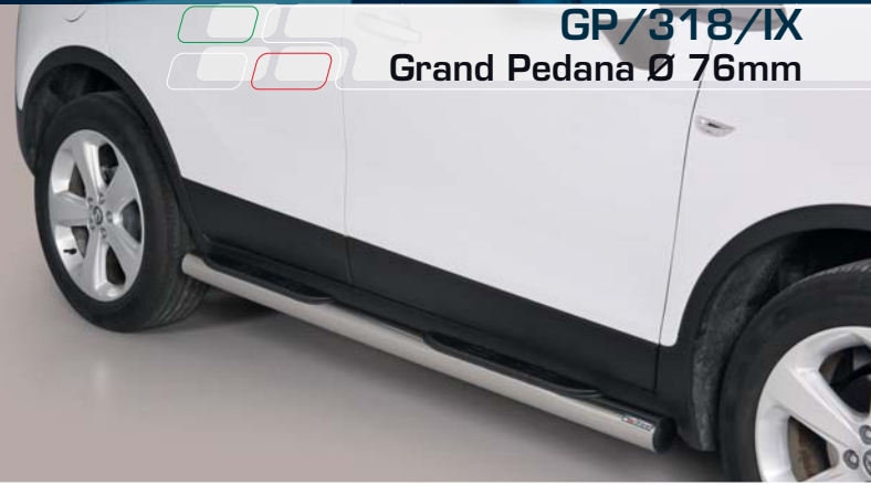
GP/318/IX Grand Pedana Ø 76mm