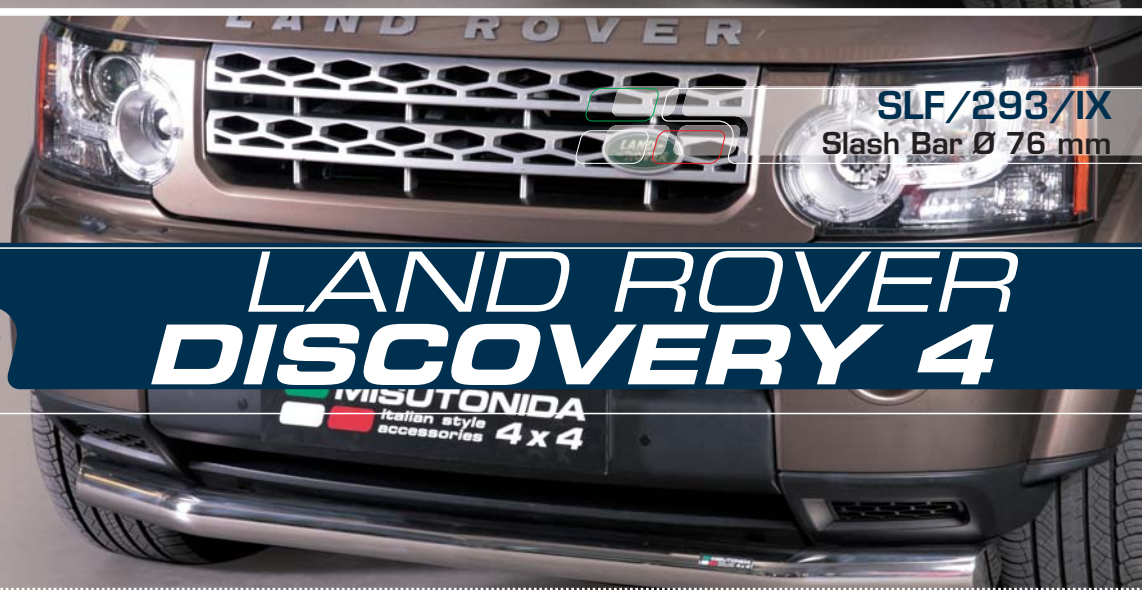
SLF/293/IX Slash Bar Ø 76 mm