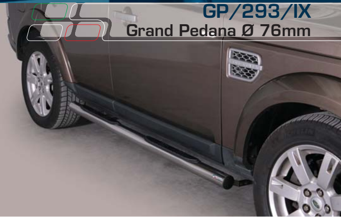
GP/293/IX Grand Pedana Ø 76mm