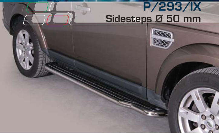
P/293/IX Sidesteps Ø 50 mm

MISUTONIDA italian style accessories 4x4