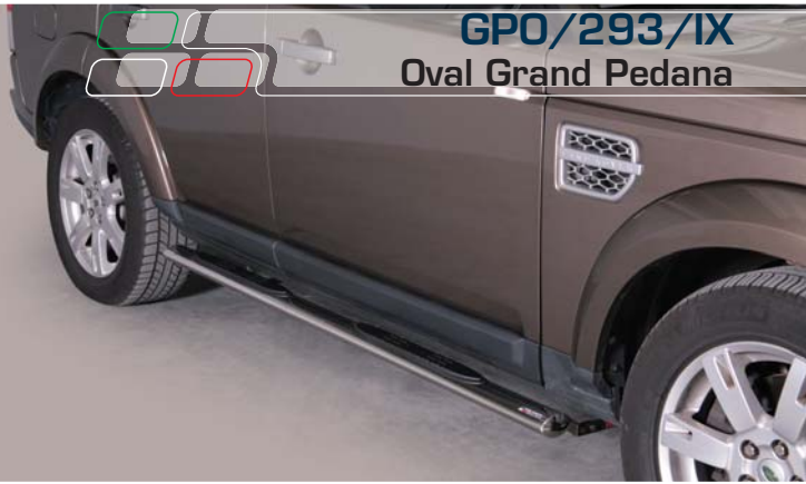
GPO/293/IX Oval Grand Pedana