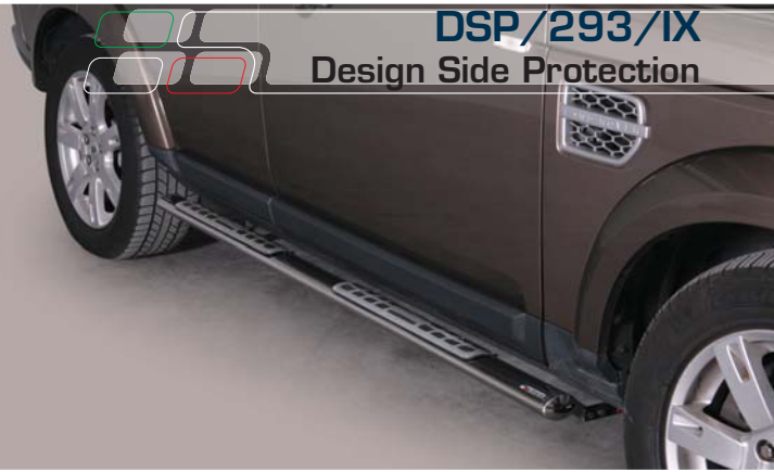
DSP/293/IX Design Side Protection