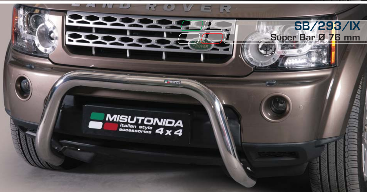
SB/293/IX Super Bar Ø 76 mm