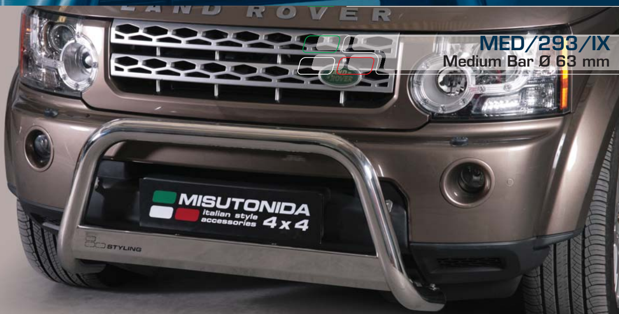
MED/293/IX Medium Bar Ø 63 mm

MISUTONIDA italian style accessories 4x4