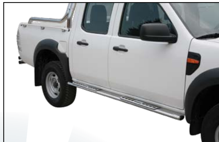
DSP/250/IX Design Side Protection