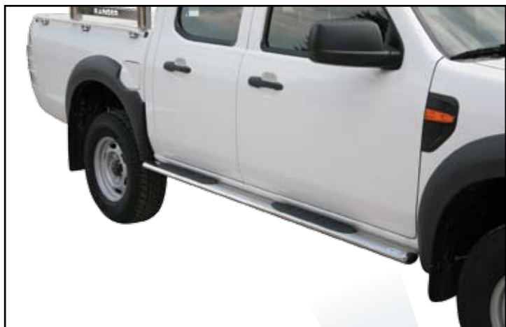
GPO/250/IX Oval Grand Pedana