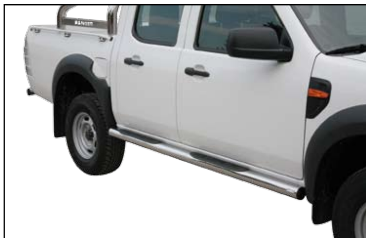
GP/250/IX Grand Pedana Ø 76 mm