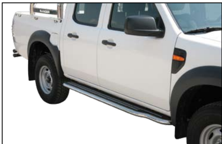
P/250/IX Sidesteps Ø 50 mm