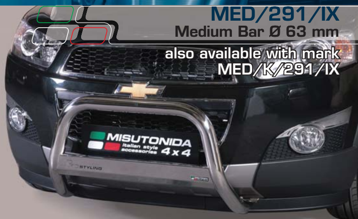
MED/291/IX Medium Bar Ø 63 mm also available with mark MED/K/291/IX

MISUTONIDA italian style accessories 4x4