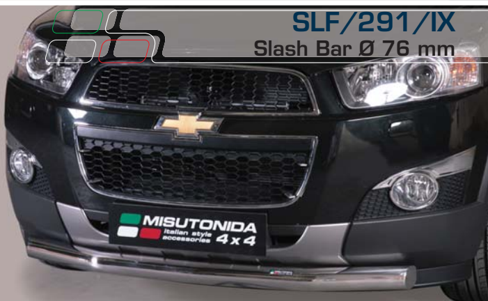
SLF/291/IX Slash Bar Ø 76 mm