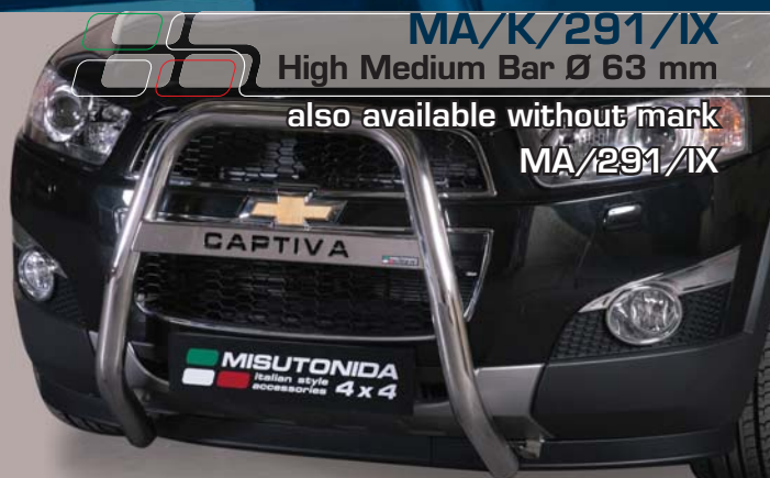
MA/K/291/IX High Medium Bar Ø 63 mm also available without mark MA/291/IX