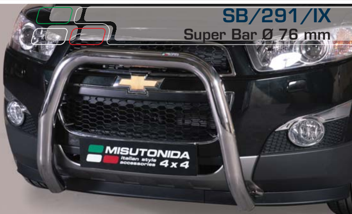
SB/291/IX Super Bar Ø 76 mm